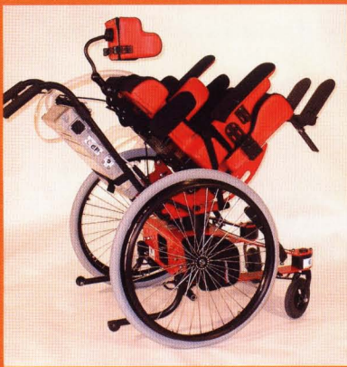
TheBUG OiS – Shown here with the Pulmonetics LTV 900 vent system.

The batteries are integrated into the frame and are removable.